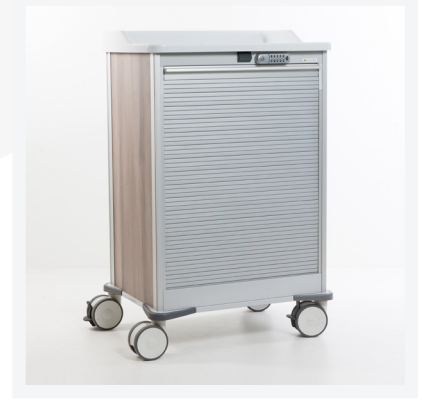
Medicart Drawers Standard & Small